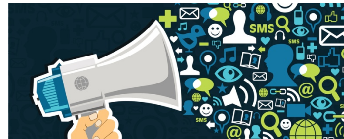
Good faith and public relations

Building trust and innovative privacy solutions