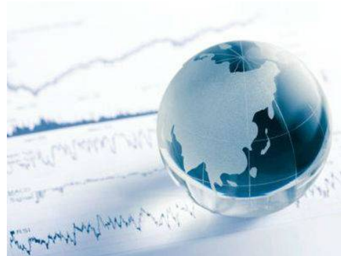
Foreign direct investment