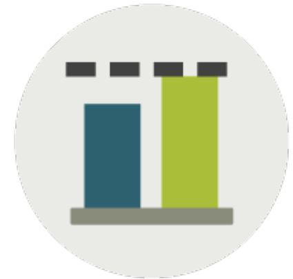
Raise the benchmark

Building trust and innovative privacy solutions