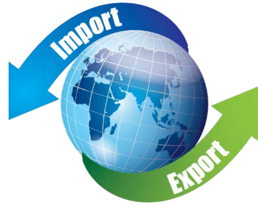
Importing and exporting