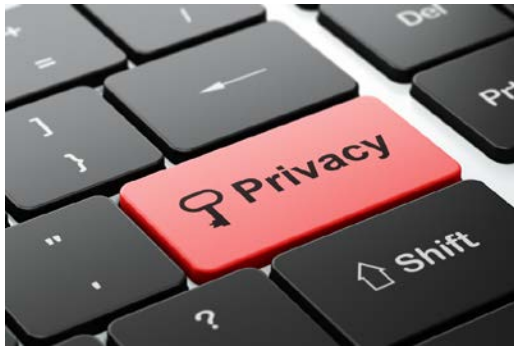
Appropriate privacy protection