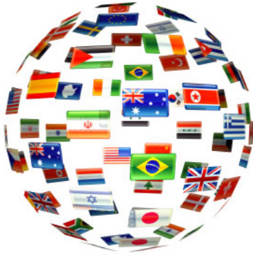
Global trade and economic growth