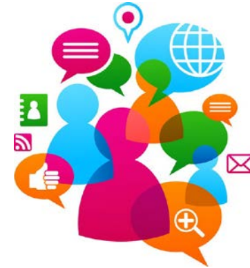
Communication with customers