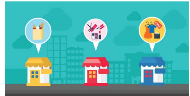
Small and medium enterprise

Building trust and innovative privacy solutions